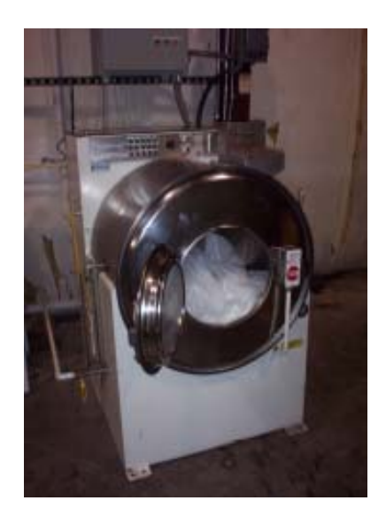
<u>Figure 3</u>. 50 pound Milnor washer/extractor installed at Anovotek, LLC laboratory.

The pilot-scale washer/extractor and chemical addition system has the following basic specifications: