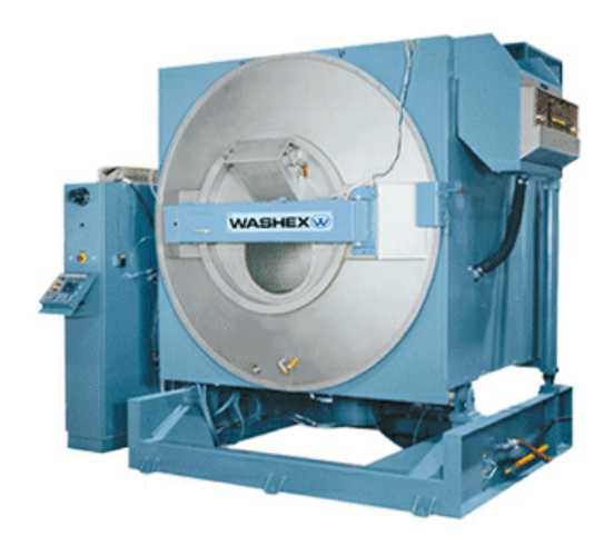
Figure 1. Washex DPM 5000 end-loading washer/extractor.

After the chemical application process is complete, the treated nets are transported from the washer/extractor to an industrial gas fired or steam heated dryer such as the Washex Challenge CPG 600 shown in Figure 2. Net transportation options range from manual carts and overhead sling systems to fully automated conveyor handling systems.