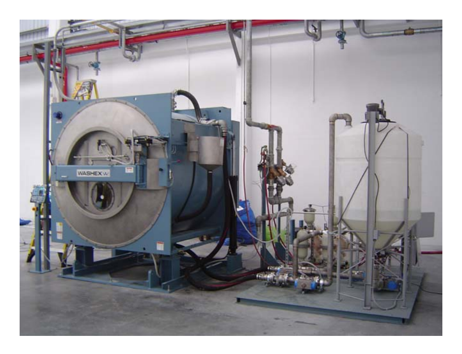
<u>Figure 6</u>. LLIN Chemical Feed System engineered, built and integrated into Washex DPM 5000 washer/extractor by Texchine, Inc.