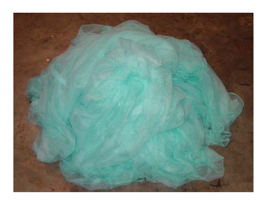
Figure 5. Five (5) nets treated with tint over a 5 minute time period and then allowed to tumble for an additional 15 minutes (note the consistency of color between the nets).

As shown in Table II, wet pick-up of the nets averaged 49.3%, and the standard deviation of net-to-net wet pick-up was quite low.