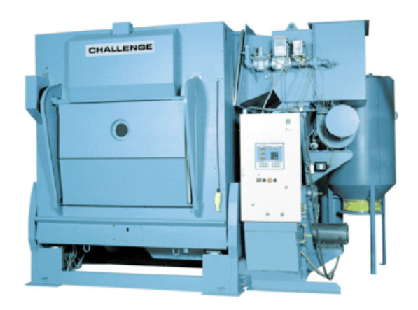
Figure 2. Washex Challenge CPG 600 industrial dryer.

After the chemical application process is complete, the treated nets are transported from the washer/extractor to an industrial gas fired or steam heated dryer such as the Washex Challenge CPG 600 shown in Figure 2. Net transportation options range from manual carts and overhead sling systems to fully automated conveyor handling systems.